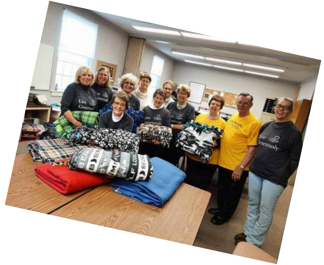
Activities pictured here: Kreative Kids, Blanket Brigade, ARM & 6 th St. Shelter Collections, Brunch Buddies, Holiday Hope Chest gift wrapping, Notes of Appreciation