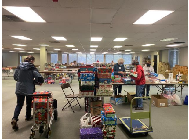
Delivering the boxes