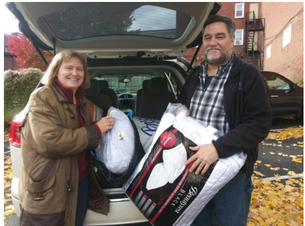
Delivering donated bedding to 6 th Street Shelter