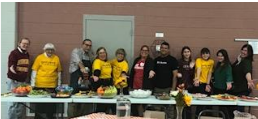
The Brunch Bunch