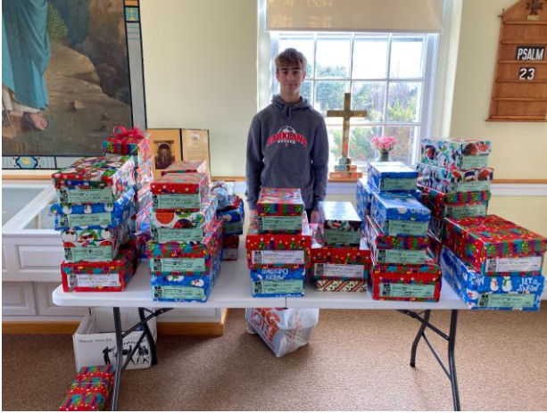
Holiday Hope Chest boxes contributed by Jordan members