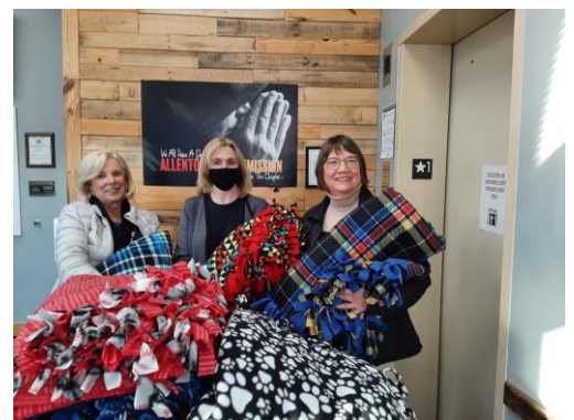
Blanket Brigade making a delivery